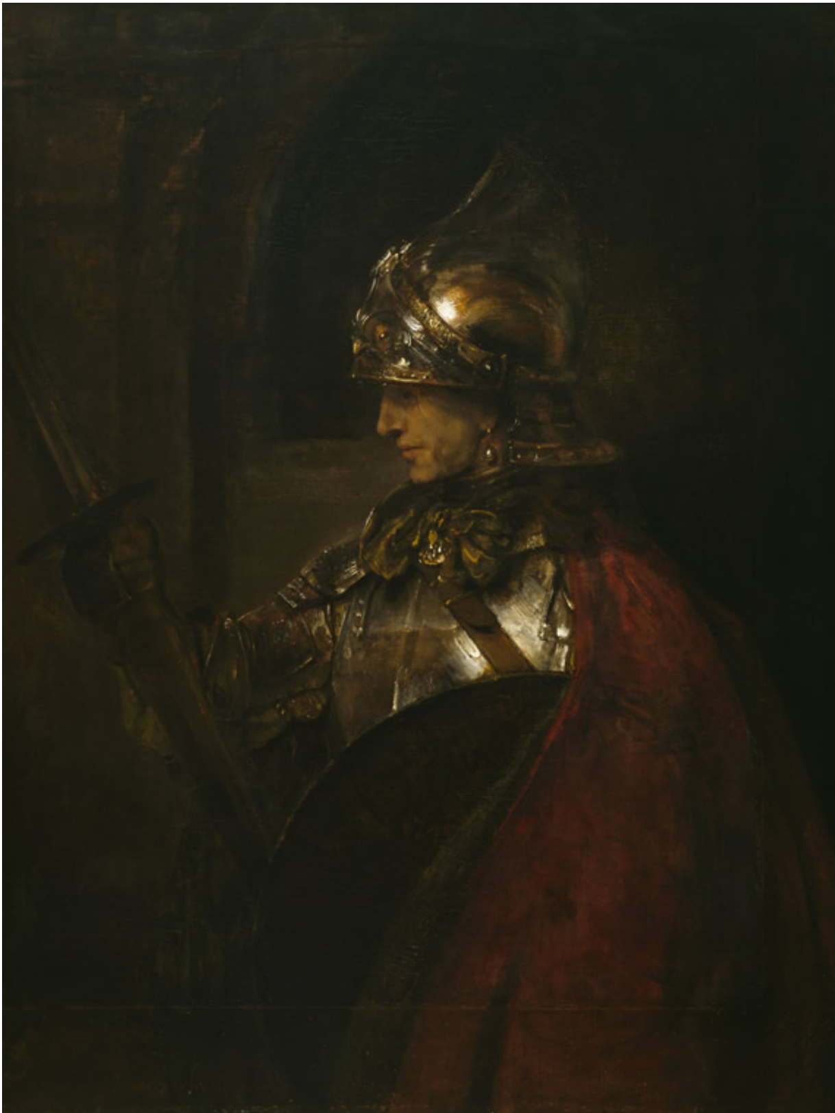
A Man in Armour (Alexander the Great?), 1655