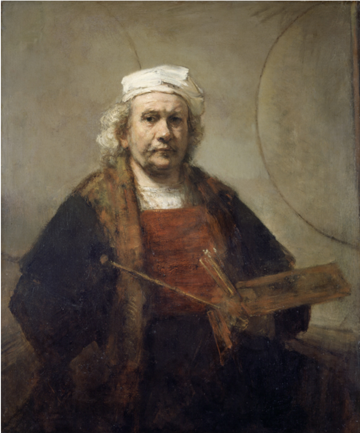
Self-Portrait with Two Circles , about 1665-9

and the beady eyes have seen everything and nothing surprises. The body is weak and no matter how extravagantly costumed, it sags under its existential burdens.