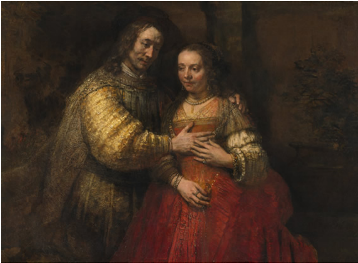
Portrait of a Couple as Isaac and Rebecca , known as 'The Jewish Bride', about 1665 Oil on canvas 121.5 x 166.5 cm Rijksmuseum, on loan from the City of Amsterdam